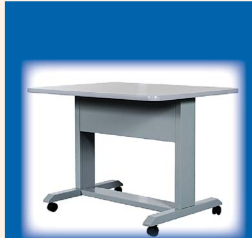
Figure 1 Standard Table With Laminate Work Surface