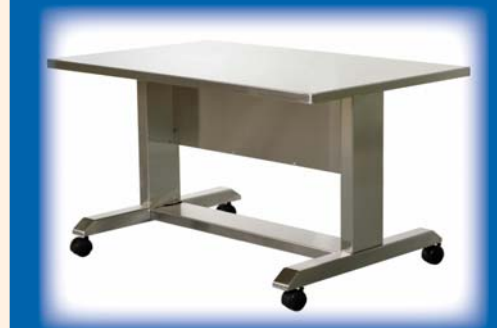
Figure 2 All Stainless Steel Construction