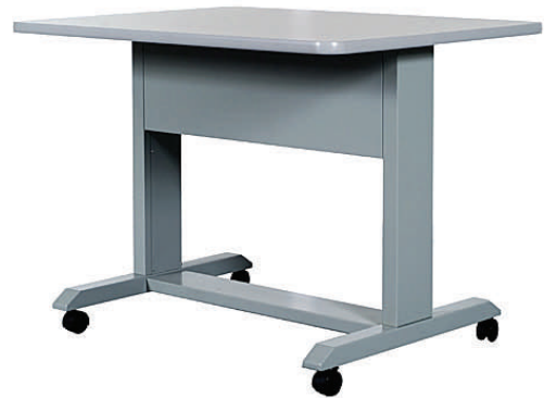
Standard Table with Laminate Work Surface