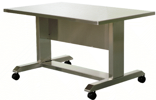
All Stainless Steel Construction